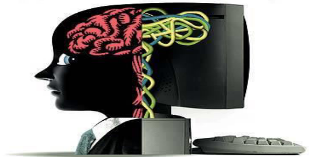
Fig 1.1 Blue Cryonics Technology Data Conversion

This procedure can begin only after the clinical death of a person. Cryonic procedure begin within the minutes of death of a person. After preserving the body process of storing information from a dead person will be initiated with the help of blue brain technology. Blue Brain Technology is a process of storing information. Both techniques will be a base of achieving immortality in future. Don't you think, it will an amazing reality that make the use of intelligence of human brain in the best way? Currently this technology seems to be just like a sci-fi movies thought. Another question is, can we get a person brain if that person dies. Certainly by using this technology, in future we can talk to a person who is not alive. Blue Cryonic is first going to save the information of a human brain with the help of blue gene technology. as after death of a person brain can not retain its information. so it will be necessary to store the information of human brain.